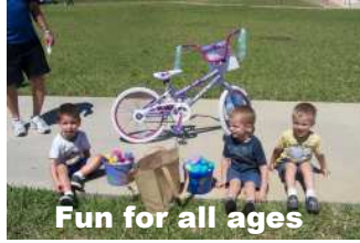
Fun for all ages