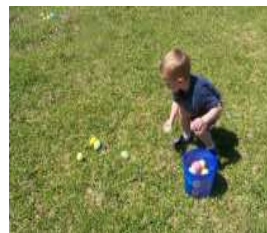
Egg hunt—who got the $1.00 bills?