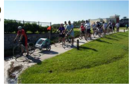
Bikers start their 5 or 10 mile ride

Thank you to our Sponsors who helped make this event possible.