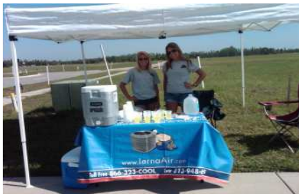
Ierna's Heating & Cooling was a Rest Stop Sponsor