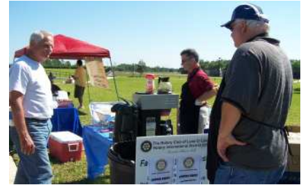
Rotary Club of Land O' Lakes sponsored the lunch