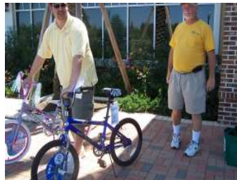
Bikes donated by Bay Cities Bank and Great Britain Tile